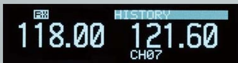
Operating information is clearly shown on the OLED display.

A fixed mount VHF airband first! The IC-A210 has an organic light emitting diode (OLED) display. The OLED display emits light by itself and the display offers many advantages in brightness, vividness, high contrast, wide viewing angle and response time compared to a conventional display. In addition, the auto dimmer function adjusts the display for optimum brightness at day or night.